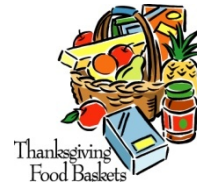
Thanksgiving Food Baskets

With your help our Youth can help create Thanksgiving feasts for community families. Between October 25 and November 22, please bring non-perishable items for our family boxes. Two large containers will be placed in Bigler Lobby to collect the food stuffs you bring.